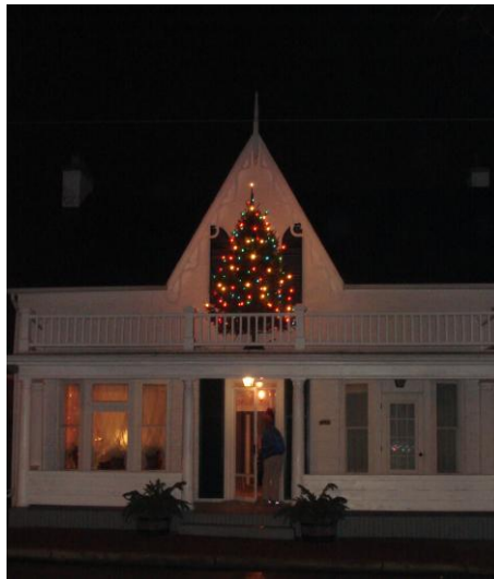
The Voelker House, 2012.