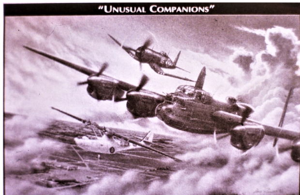
Victoria Cross Flight shows the three aircraft whose Canadian airmen won the Victoria Cross