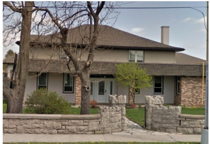
The renovated Binkley house at 500 Mohawk Road West is now St. Martin's Manor. The elegant front entrance is a replica of the original.