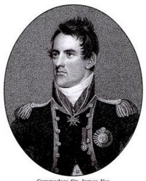
Commodore Str James Yeo NAC C22895

Surprisingly, when the City Planning Department, decided to simplify the city's geography by identifying neighbourhood areas by names, they randomly chose the name Yeoville for a central mountain locale bounded on the east by Upper James Street. This small nondescript residential survey is squeezed in between West 5th, Mohawk Road and the Lincoln Alexander Parkway. It is named in honour of Commodore Sir James Lucas Yeo, Royal Navy , one of our country's unsung naval heroes of the pre-confederation period.