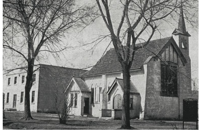
The original 1916 white stucco Olivet Union Church and 1918 Sunday School shown here were demolished in 1949 and replaced with the present brick church and Christian Education building.

Increased church attendance in the 1930s resulted in worship being moved from the original structure to the Sunday School building. Both buildings were demolished in 1949 and during 1949-50 the congregation gathered in the auditorium of the recently opened Queensdale Public School (1948).