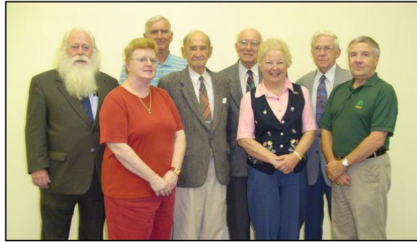
HMHS Executive in 2000

Bailey's Bulletin is published three times per year.