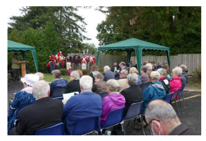
Ceremony with Lincoln Militia reenactors.