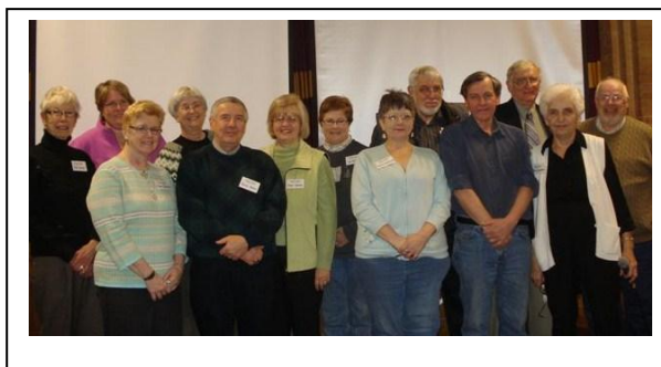
HMHS Executive for 2010

Bailey's Bulletin is published three times per year.